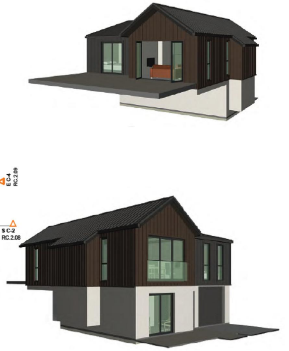
TYPE C TYPOLOGY FLOOR PLAN & PERSPECTIVES