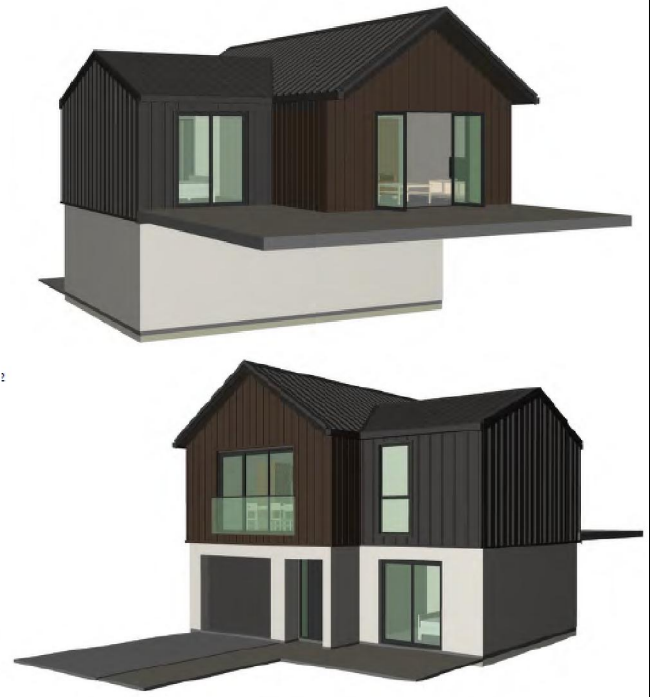
TYPE A TYPOLOGY FLOOR PLAN & PERSPECTIVES