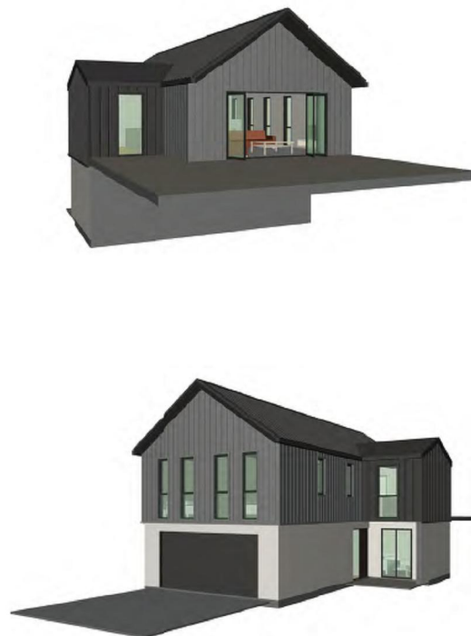
TYPE D1 TYPOLOGY FLOOR PLAN & PERSPECTIVES